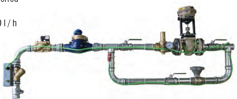
Water dosing unit with electro-pneumatic valve WDU - complete piping