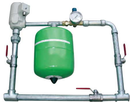
Water dosing unit with dosing valve DEW 2500/1-2